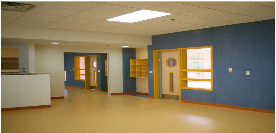
Child-scaled windows in the wall and doors in childcare center in Kansas City, MO

The needs assessment serves as the basis for the project program. The program is a complete and detailed document that includes project goals and objectives, project components, the attributes of each component, a budget and schedule, as well as a description of the roles and responsibilities of the parties involved in the project.