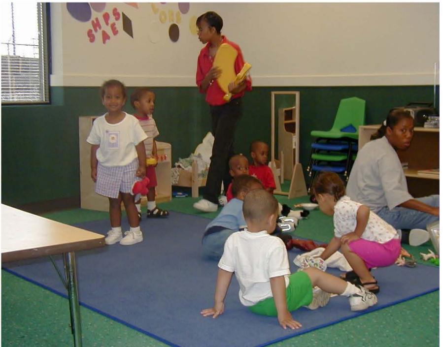
Linden Transit Center, Columbus, OH