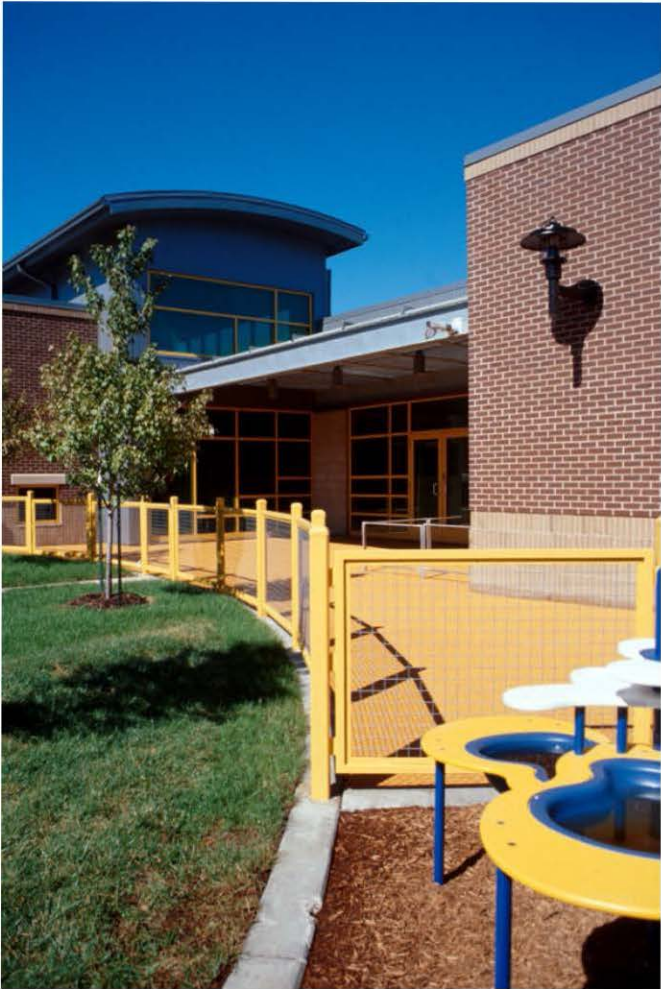
Kansas City Childcare Center 39th & Troost Metro Center KC, MO

transit, in recognition of transportation as the lifeblood of communities. The FTA uses joint development as a tool for improving the quality of life in communities.