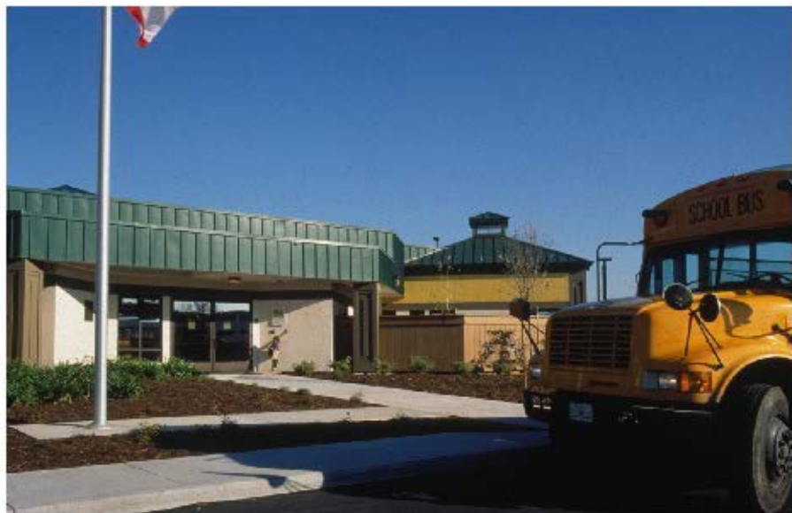
Tamien Childcare Center, Santa Clara VTA, San Jose, CA