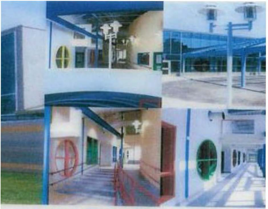
Louis Stokes Rapid Transit Station, Cleveland, OH