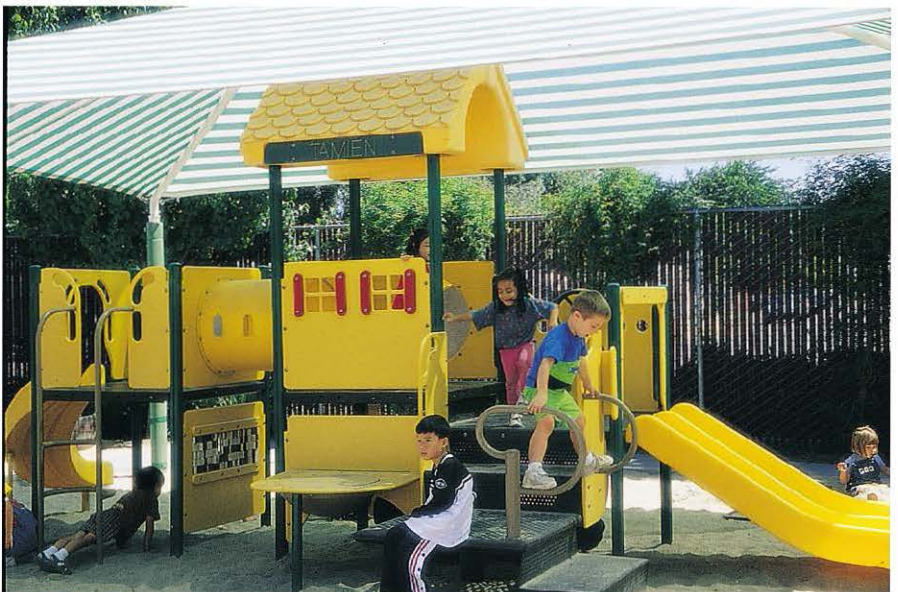
Tamien Childcare Center, Santa Clara VTA, San Jose, CA