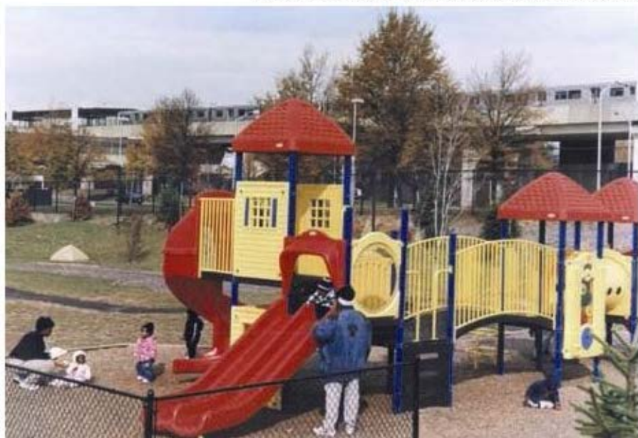
Louis Stokes Rapid Transit Station, Cleveland, OH