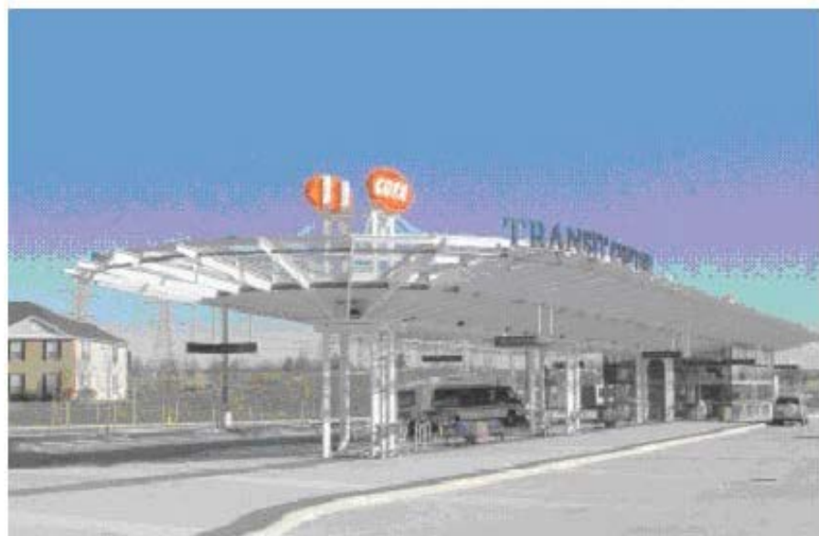
Easton Transit Center, Columbus, OH

The following case studies illustrate a variety of sites, partnerships, and funding arrangements which were successful in meeting the needs of working families and transit riders.