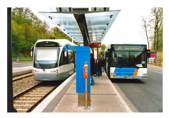
Figure 1. Bus and rail sharing the same platform, enabling a seamless connection.

We found that adding feeder-bus service had a dramatic effect on rail's cost-effectiveness. For medium-to-large